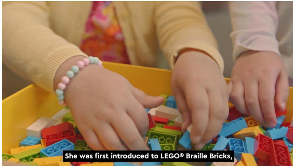
Lego Braille Brick Intro Video

Perfect for anyone interested in accessible learning through play, this session proves that when it comes to creativity, there are no limits, only possibilities.