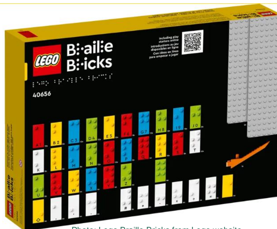
Photo: Lego Braille Bricks from Lego website