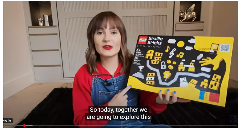
Molly Burke Unboxing Video